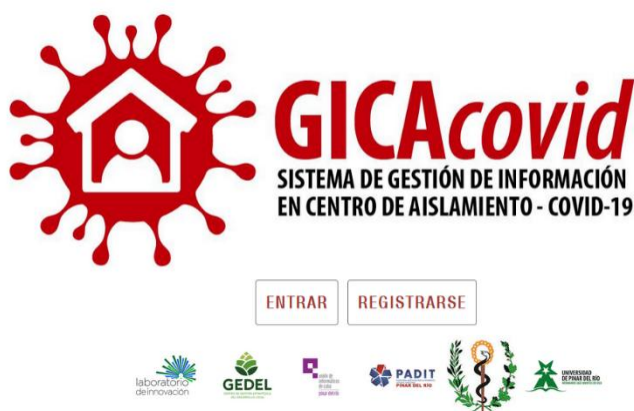
Fig. 1 Main interface GICA-Covid. 2020

To access the application, the user must employ his/her access credentials (username and password). The roles handled during the development of the system were: Administrator and Statistician. It is valid to emphasize that the management of users is made only by the administrator of the system, with which to be able to create the Statistical user of an isolation center, firstly it must be requested to the administrator. In addition, a statistician will only have access to the information of the isolation center in which s/he works. (Fig. 1)